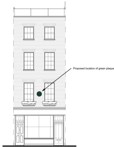
5 NEWBURGH STREET ELEVATION