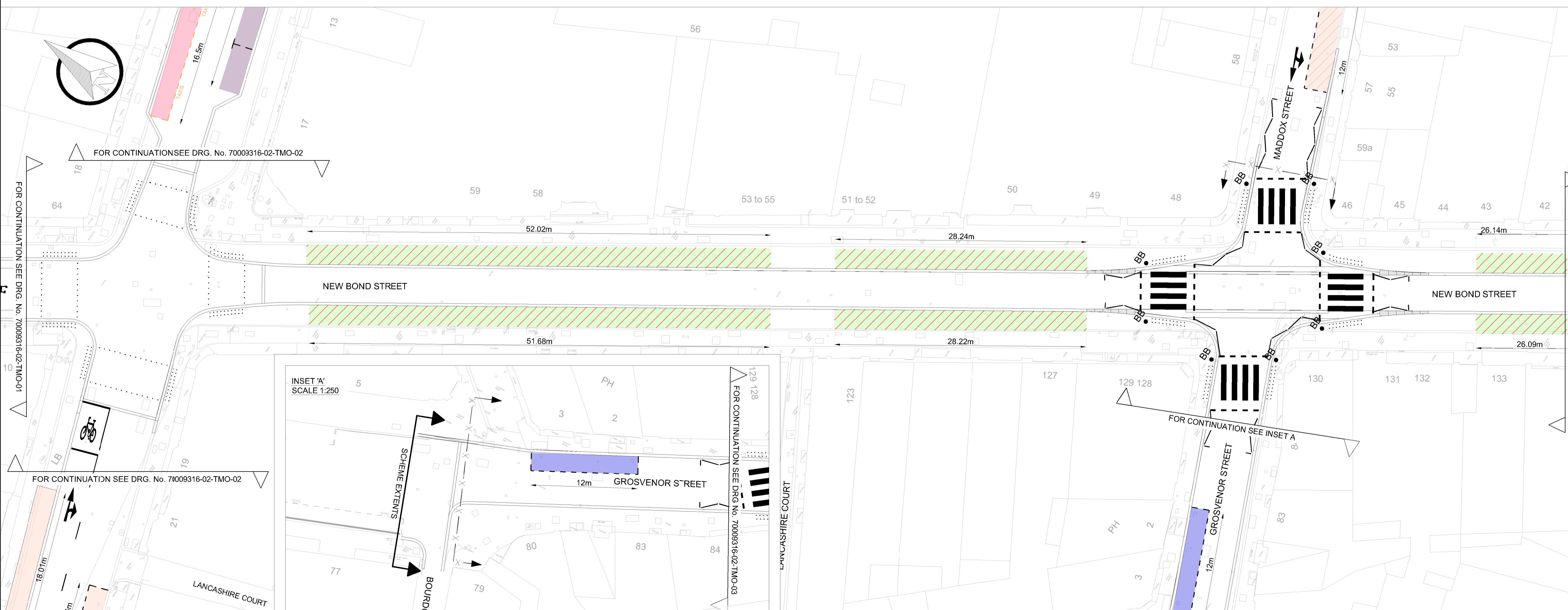
PROPOSED TMO LAYOUT SHEET 3