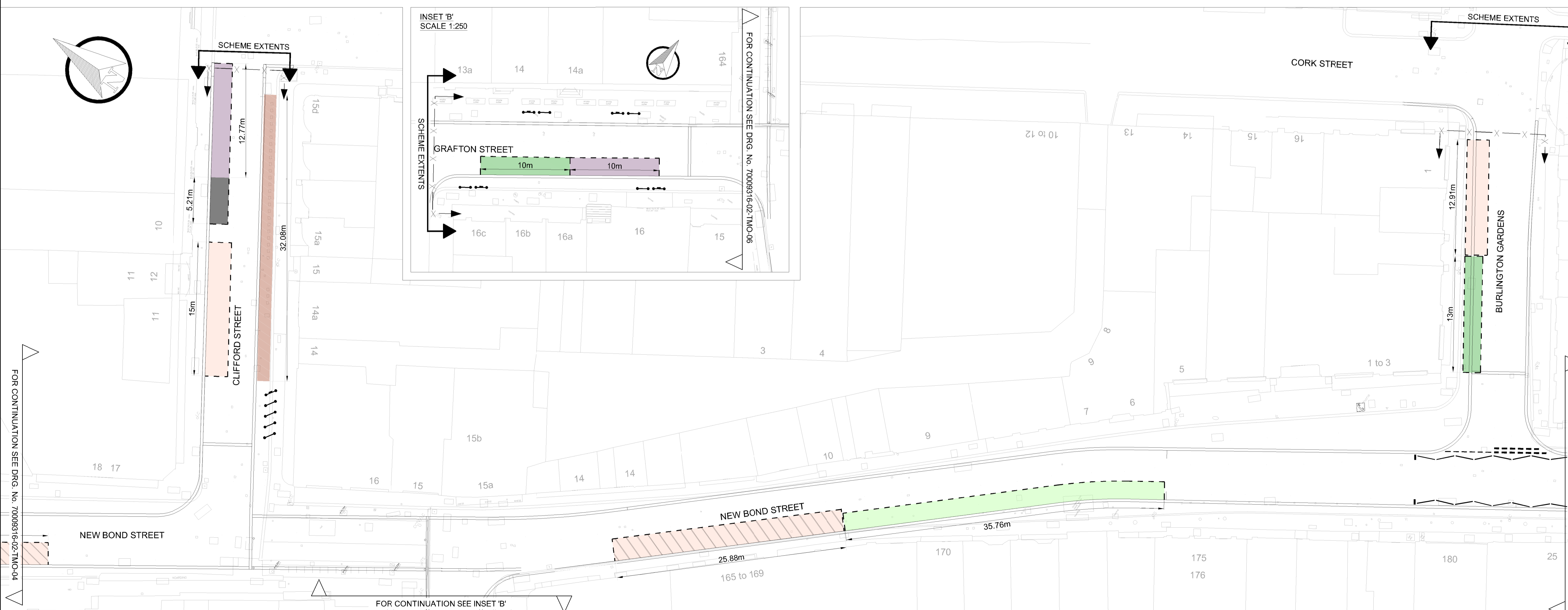
PROPOSED TMO LAYOUT SHEET 6