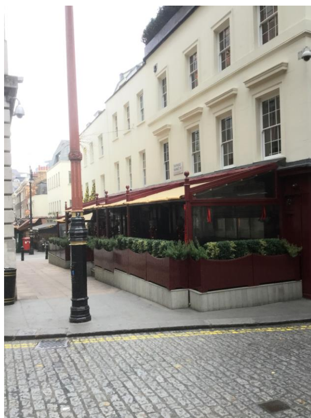
View from Market Mews (below)