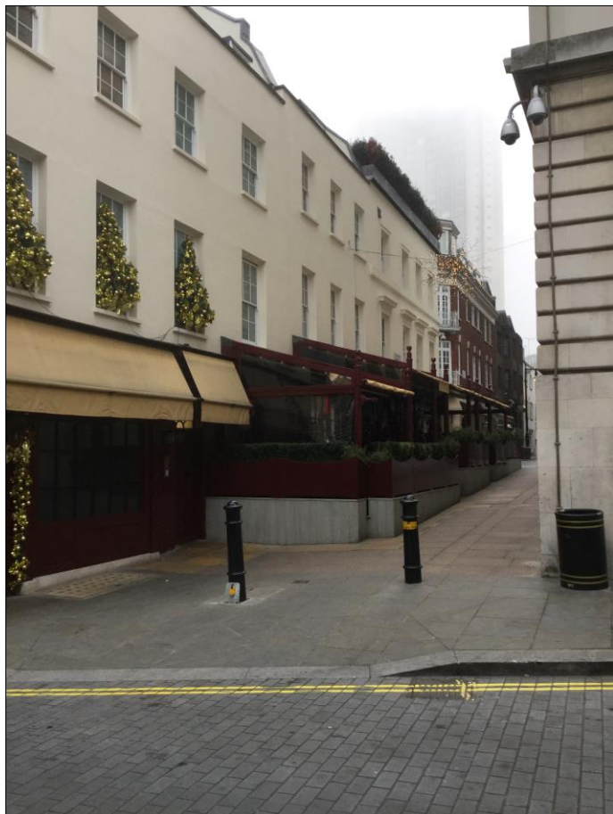
View from Shepherd Market (top)