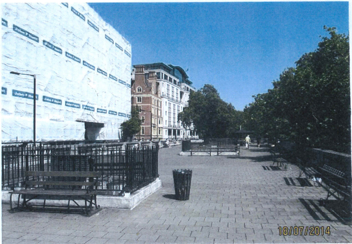
Temple Place (top) and Temple Underground Station roof (bottom)