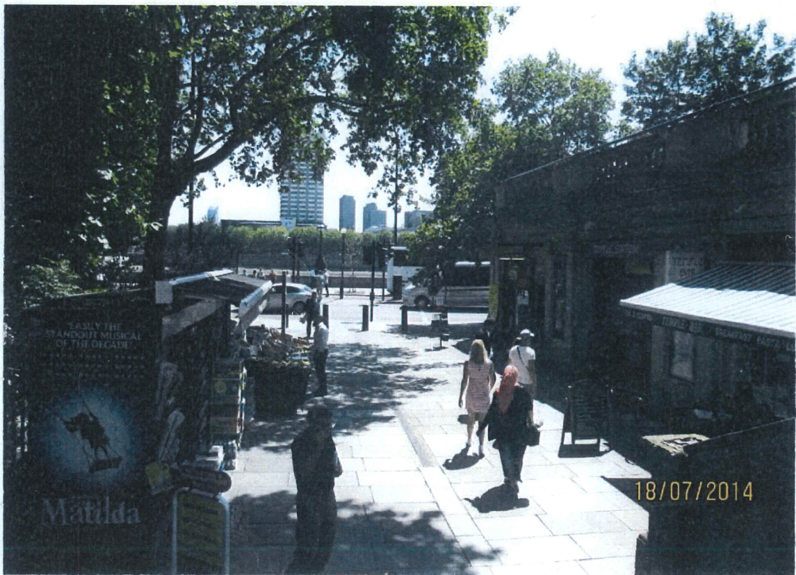
Birds eye view of river (top) and outside Temple station (bottom)