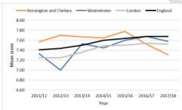
Chart 1: Life satisfaction trend