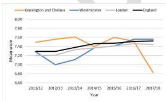
Chart 3: Happiness trend