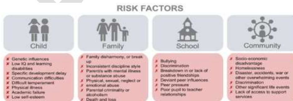
Figure 1: Risk factors for children and young people’s mental health and wellbeing

The figure below summarises the known risk factors associated with children and young people developing mental illness.