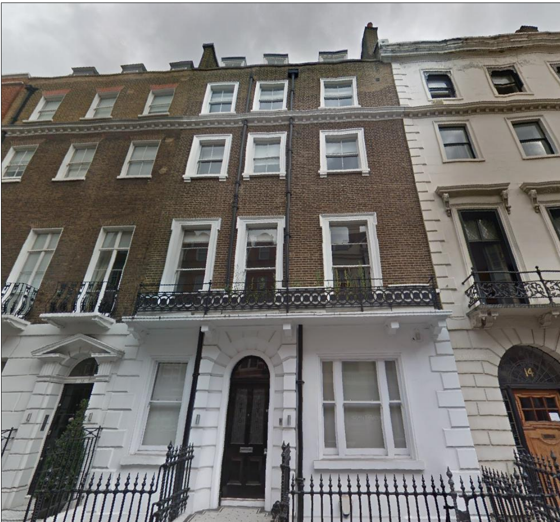
Front façade of 15 Wimpole Street