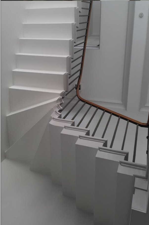
Above: view of staircase from the first floor to the ground floor