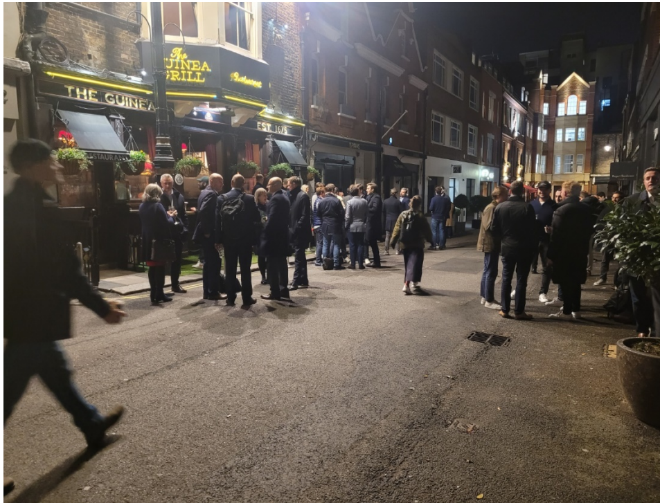
Outside Guinea Grill, 17.45 hours on 9/11/22.

3.6 At times, the road was completely blocked by these customers, mainly men, standing drinking and chatting. Bruton Place was fortunately not very busy with traffic and is a one-way road, however on occasion the traffic was brought to a standstill by the crowds and had to thread its way through the drinkers, sometimes sounding the horn to warn them and encourage them to move. This causes inconvenience to road users and danger to those standing in the road drinking who are sometimes reluctant to move.