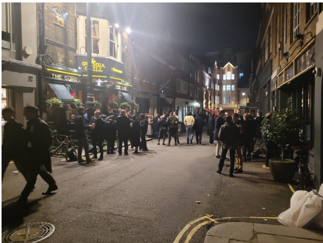
Outside Guinea Grill, 20.03 hours on 9/11/22.

3.11 The crowds outside remained all evening. Walking around the vicinity I observed discarded glasses on windowsills of nearby premises and occasional pieces of broken glass in the road where a glass had been dropped and broken. I observed a male, dressed in suit trousers and a waistcoat with long grey hair in a ponytail, walking around and clearing up empty glasses that had been left discarded, but no attempt was made to move customers from the road or manage them in any way. I did not see any door supervisors at the premises.