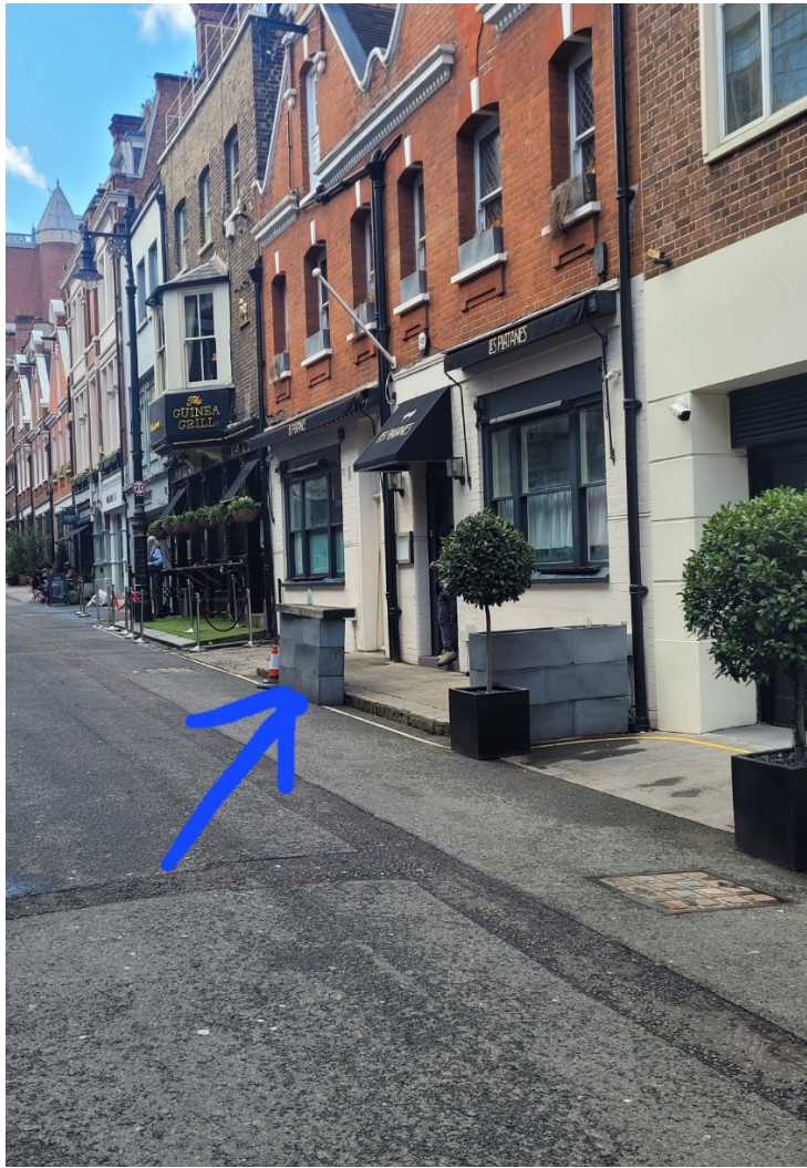
Image showing Guinea Grill in background with rope barriers outside and 'counter' placed in road outside Les Platanes next door.

3.4 Next door on the other side at 32 Bruton Place is currently an art gallery. This premises is subject of a new licence application from Young & Co's Brewery Plc to extend the restaurant facilities at The Guinea to make one premises, 30-32, Bruton Place. This application will greatly increase the restaurant facilities but does not increase the bar size or capacity.