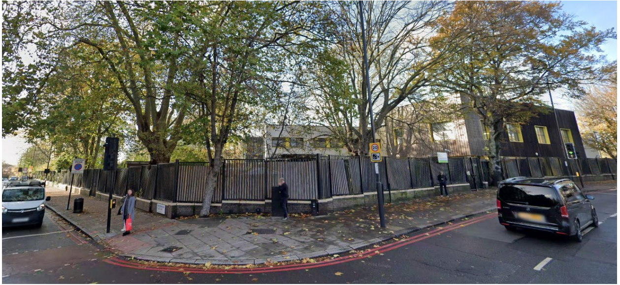
Image of Ormiston Academy from corner of Finchley Road and Marlborough Place